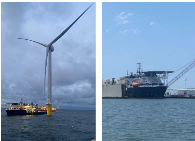
The Cade Candies underwent a retrofit in Port Fouchon, LA so that she could work on the Vineyard Wind Project in Massachusetts. This vessel serves the offshore energy industry: oil, gas, and wind.