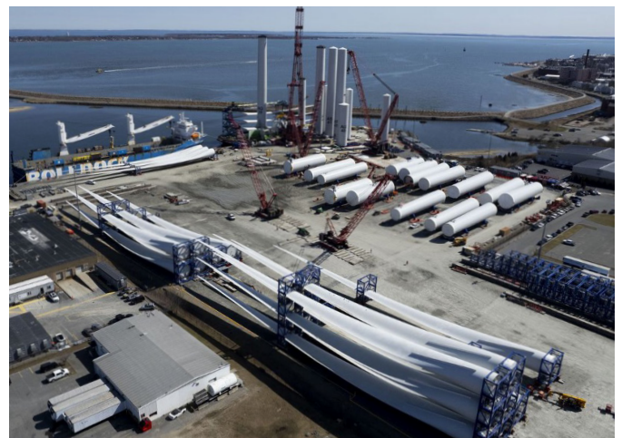
Top: A load out of blades for the South Fork Wind Farm in ProvPort, RI on a Crowley barge.