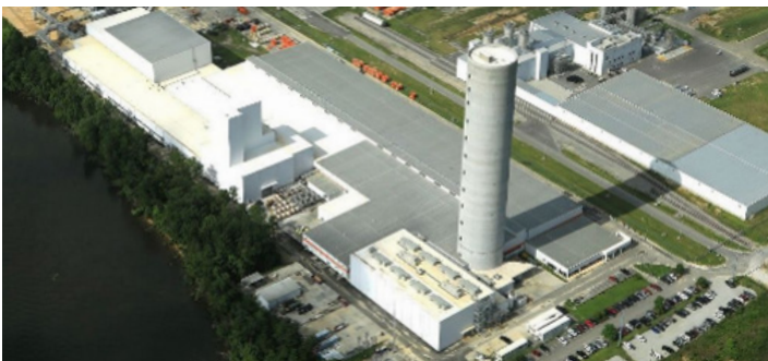
Nexans cable facility in Goose Creek, SC.

The Port of Virginia saw over $223 million in investment to support the construction of Dominion Energy’s Coastal Virginia Offshore Wind Project.