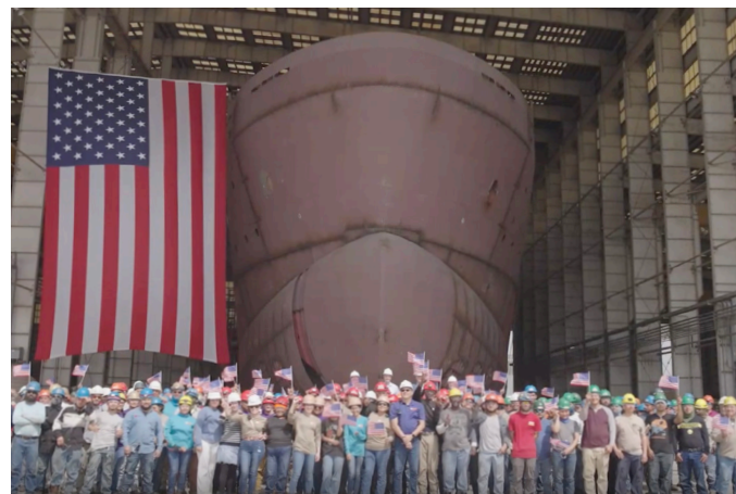
American workers helped construct the ECO Edison at LA Ship in Houma, LA. The vessel is now in service in New England.