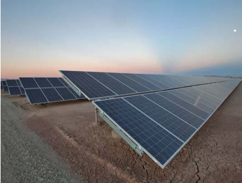
The moon shines over a solar plant near the southern end of the Salton Sea, in California's Imperial Valley, on Nov. 23, 2015.

Ralph Cavanagh from the Natural Resources Defense Council lamented the bill's failure, arguing that "the need for western grid integration grows more obvious each day."