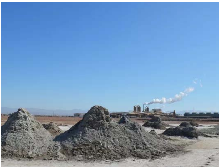
EnergySource's Featherstone geothermal plant by the Salton Sea belches steam on April 29, 2016, with mud pots in the foreground.