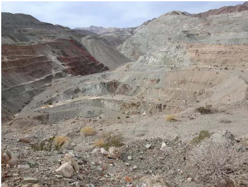
An open pit that was used for iron mining in the Eagle Mountain area, near Joshua Tree National Park.