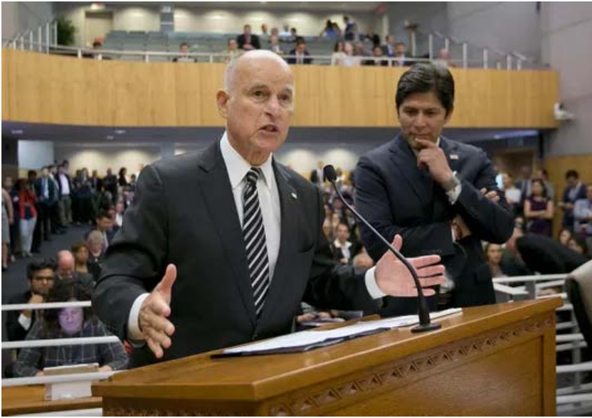
In this July 13, 2017 file photo, Gov. Jerry Brown, left, flanked by Kevin de León, urges members of the California Senate's Environmental Quality Committee to approve a pair of bills to extend the state's cap-and-trade program.

There's been speculation in Sacramento that Gov. Brown may not sign SB 100, either because he's unhappy about the failure of AB 813 or because the bill would give de León a powerful talking point in his bid to defeat Feinstein, an ally of Brown's. But for Brown not to sign SB 100 would be seen as a dramatic rejection of his own carefully cultivated legacy as a global leader on climate change . (story/news/environment/2015/11/14/paris-climate-talks-nations-look-california/75540806/) . The governor is scheduled to co-chair an international climate action summit in San Francisco starting September 12.