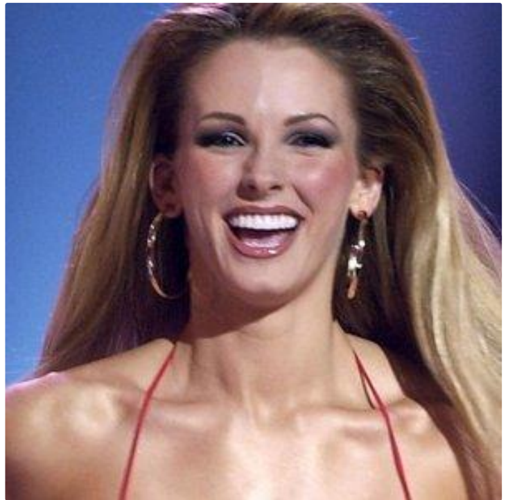
Science Says This Body Type Is the Most Attractive Now