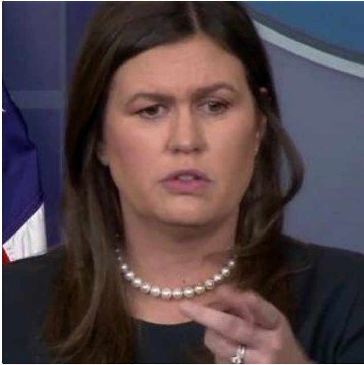
CNN Reporter Walks Out of Press Briefing After Heated Exchange