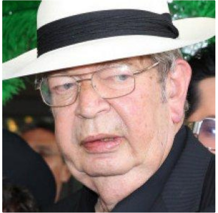
'Old Man' From 'Pawn Stars' Cuts Son Out of His Will