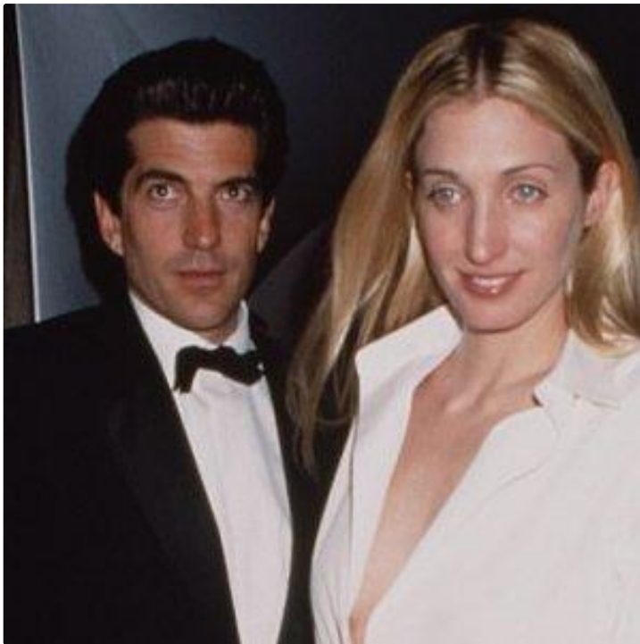
Weird Things Everyone Just Ignored About JFK Jr.'s Marriage