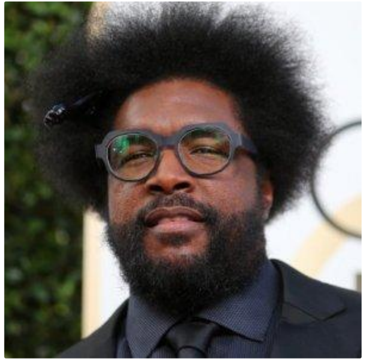
Fired 'Tonight Show' Staffers File Lawsuit