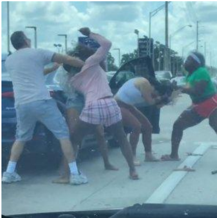
Road Rage Turns Into Brutal Beatdown at a Traffic Light