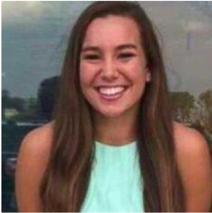
New Details Emerge in Case of Missing Iowa Student